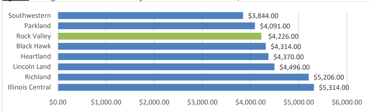
Figure 2: Average Loan Amount Received by Full-time First-time Students, RVC and Peer Institutions 2019-2020