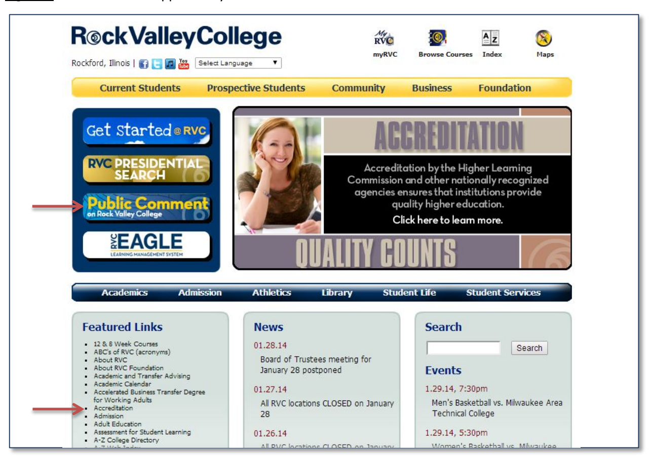
Figure 1: Notification of Opportunity to Comment

The Commission shall seek comment from third parties about institutions being evaluated for accreditation or candidacy. As part of the comprehensive evaluation, institutions shall publicize the forthcoming evaluation in accordance with established Commission procedures regarding content, dissemination, and timing.