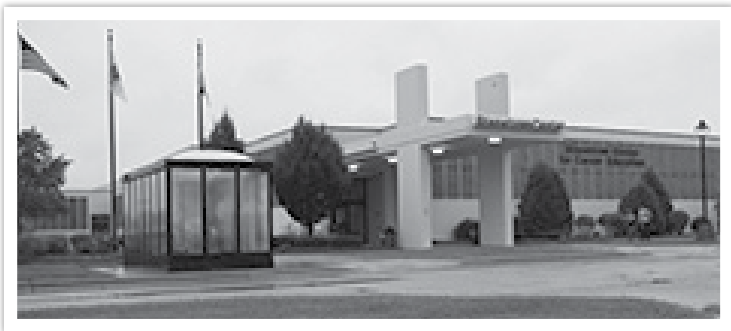
SAMUELSON ROAD CENTER (SAML) located at 4151 Samuelson Road, Rockford, IL 61109 just east of Rockford Jefferson High School