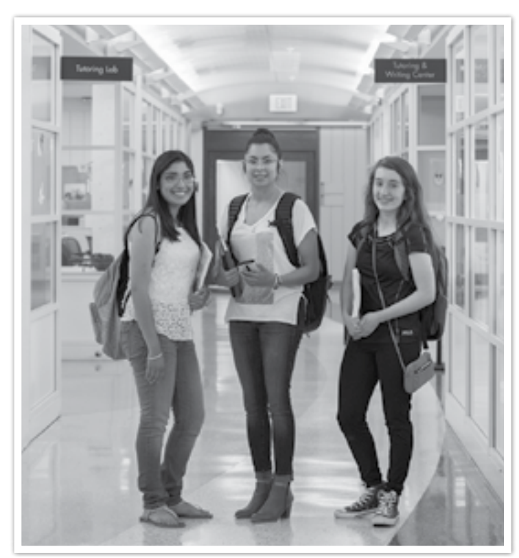
MAIN CAMPUS Stenstrom Student Center, ground floor

The student may choose to have an "advisor or support person" accompany them during the meeting (such as a peer, friend, family member, or Rock Valley College employee). The advisor/support person may be present during the