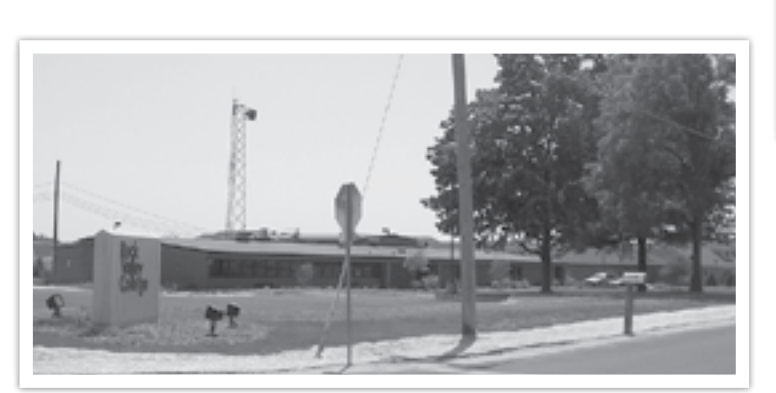
BELL SCHOOL ROAD CENTER (BELL) located at 3350 N. Bell School Road, Rockford, IL 61114 Home to the Center for Learning in Retirement–CLR on the southwest corner of N. Bell School & Spring Brook Roads

Center (ACEC) 6045 Cessna Drive, Rockford, IL 61109 near the Chicago-Rockford International Airport